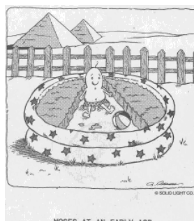
NOSES AT AN EARLY AGE

March 25, 2012, October 7, 2012, March 10, 2013, and October 13, 2013.