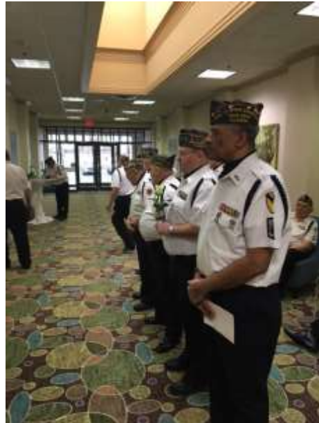
Members of Post 1288 and VFW 5917 at a recent service for a fallen veteran.

From time to time American Legion Post 1288 and VFW Post 5917 are called upon to provide the honor guard for the wake or memorial service of a veteran who has passed away. Members of both Post make up the honor guard. This is an honor which we take with pride to remember our fallen brother or sister. Though we have always been fortunate to be able to fully staff an honor guard, we could always use more help. If interested in helping out, please contact the Post, and we will put you on our list for honor guard