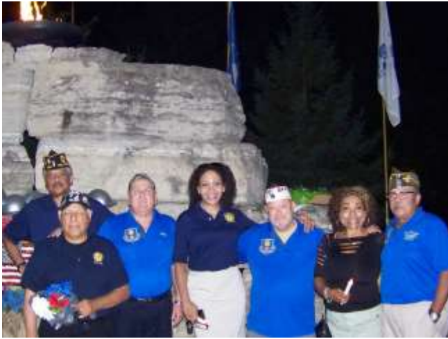
Members of Post 1288 and VFW Post 5917 gather at the Village Veteran's Memorial for the POW-MIA Recognition Day.

In 1979, Congress passed a resolution authorizing a National POW/MIA Recognition Day. On Friday, September 20, members of Post 1288 and VFW 5917 gathered at the Bolingbrook Veteran's Memorial in observance of National POW/ MIA Recognition Day. Thanks to all who took time this year to remember the service and sacrifice of our POWs as well as those who are MIA and their families.