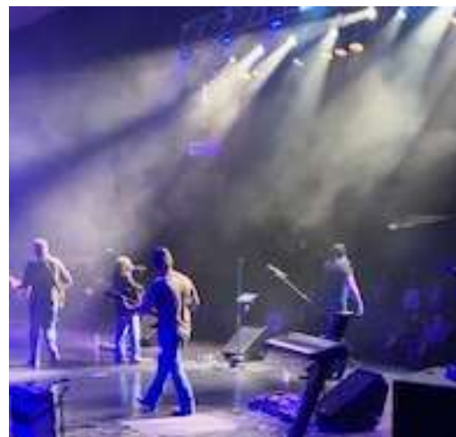
The rain didn't stop this year's 5 th annual Vet Fest. Pictured (left) members of the American Legion Post 1288 and VFW Post 5917 read off prize winners; (right) the band Within 4 Days perform the night cap at Vet Fest.