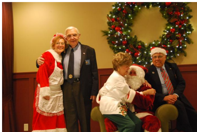
Mr. and Mrs. Santa made a stop in Bolingbrook for the annual American Legion Post 1288 & VFW Post 5917 Christmas Party.

The American Legion Post 1288 and the VFW Post 5917 held their annual Christmas Party on Saturday, Dec. 7 at the Levy center. Many members, families and friends attended this much anticipated event. There was great food, great company, great raffle prizes, activities and gifts for the kids, and dancing. Thanks to all who made this event possible.