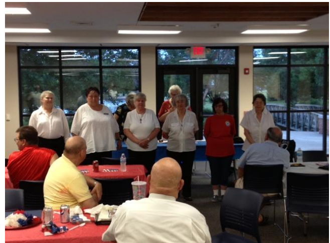
The 2013-2014 officers of the American Legion Auxiliary Post 1288 are installed and presented to the audience on July 15.

July 15, 2013 – Post 1288 and Auxiliary Post 1288 installed its Officers for the 2013-2014 period. The installation was held on July 15