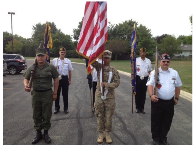
Members of Post 1288 and VFW 5917 assemble for the Color Guard detail at the annual Bolingbrook Pathways Parade.

Once again the American Legion Post 1288 and VFW 5917 participated in the annual Bolingbrook Pathways Parade entitled "Rockin & Rollin in Bolingbrook." The parade was held on September 8. Due to issues surrounding events in Syria, this year's line-up did not include any military vehicles as we had hoped. However, Post 1288 and 5917 were able to muster a motivated group of hard-charging veterans to provide the color guard detail. Special thanks to all who participated in this year's parade.